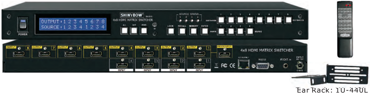
Ear Rack: 1U-440L